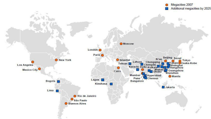
Fig. 2: World concentration of Urban centers

arrangement of urban communities, China's urbanization had an early concentrate on the element seaside urban areas, with the outcome that these urban communities now convey higher than national development midpoints. This is the starkest difference between the two nations: China, that has grasped and formed urbanization, and India, which is as yet awakening to its urban reality and its inborn open doors.